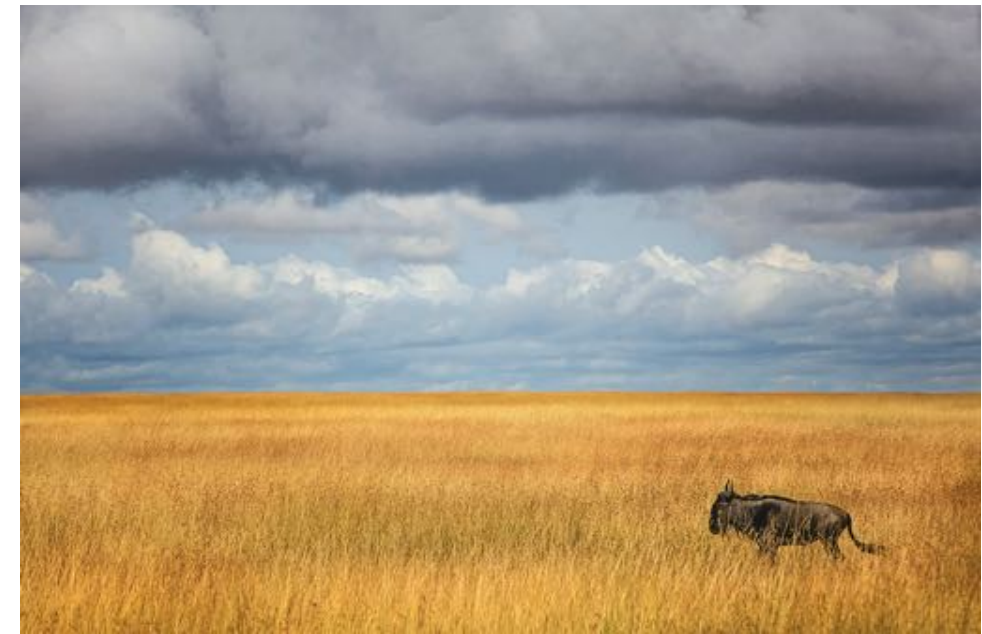
Wildebeest, Masai Mara, Kenya, Africa. Canon EOS 5D Mark II, Canon EF70-200mm F2.8L IS lens, focal length 200mm, f/11 at 1/1250 second, evaluative metering mode, auto exposure mode, ISO equivalent 400.

To demonstrate how a few tips, simple skills and ideas can create more variety and impact to your photographs, I have put together a series of images of wildebeest, generally a very boring animal that is quite drab in color. This is to help illustrate how light, mood, and motion can bring powerful visual impact to your images. The first image is chosen in the off chance you do not know what a wildebeest looks like and to remind you that simplicity is also powerful.