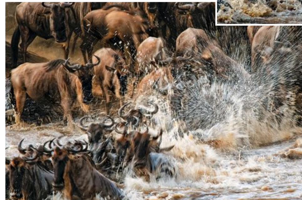
Left: Wildebeest, Masai Mara, Kenya, Africa. Canon EOS-1D Mark III, Canon EOS-1D Mark III lens, focal length 200mm, f/40 at 1/40, evaluative metering mode, auto exposure mode, ISO equivalent 540.