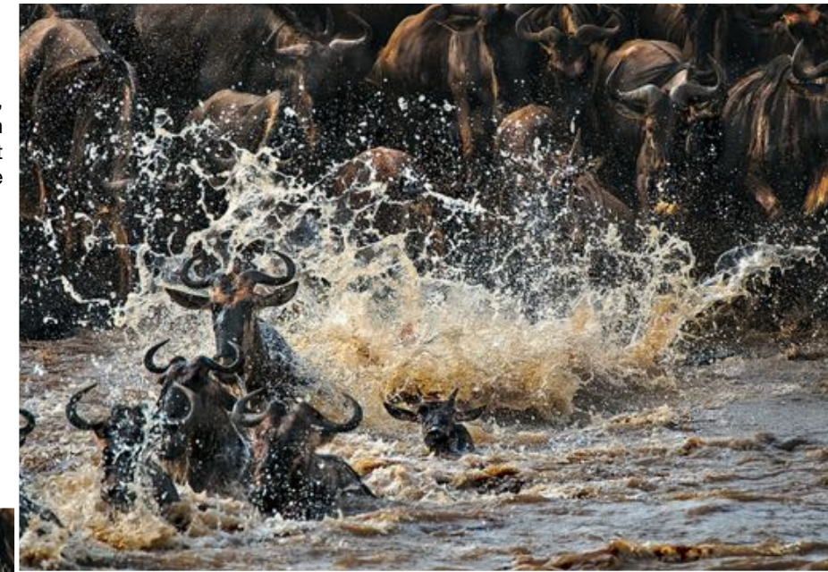
Right: Wildebeest, Masai Mara, Kenya, Africa. Canon EOS-1D Mark III, Canon EOS-1D Mark III lens, focal length 200mm, f/7.1 at 1/1600, evaluative metering mode, auto exposure mode, ISO equivalent 540.

Slow down your shutter speed. Stopping the action of animals running through water with a high shutter speed makes a dramatic image, but slowing down the shutter speed will add a fresh impact and variety to the story. Different from a pan blur, here you hold the camera still and slow down the shutter. This allows for the moving subject to create the effect of motion. Water works great as well as tall grass that is blowing or branches moving in a tree. In the first image my shutter speed was very high to stop the action and the explosion of water. In the second I slowed down the shutter to create a different mood and show the spray of the water. In the third I slowed down the shutter even more to really show the blast of the water.