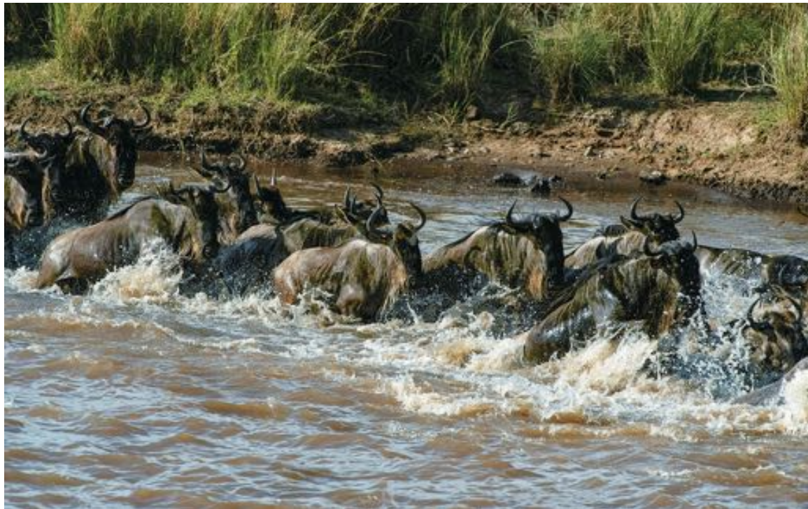
Wildebeest, Masai Mara, Kenya, Africa. Above: Nikon D4, AF-S VR Zoom-Nikkor 200-400mm F4G IF-ED lens, focal length 550mm, f/11 at 1/800 second, center-weighted metering mode, auto exposure mode, ISO equivalent 1000. Below: Canon EOS-1D Mark III, Canon EF500mm F4L IS lens, focal length 215mm, f/14 at 1/40 second, partial metering mode, auto exposure mode, ISO equivalent 63.

Here is another set of images to show the impact and difference between a fast shutter speed stopping the action and a pan blur to show motion. Notice in the second image the front wildebeest are in focus while the rest of the image has a slight blur giving the viewer a more powerful sense of motion.