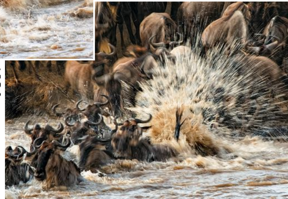
Right: Wildebeest, Masai Mara, Kenya, Africa, by Piper Mackay. Canon EOS-1D Mark III, Canon EOS-1D Mark III lens, focal length 200mm, f/40 at 1/30 second, evaluative metering mode, auto exposure mode, ISO equivalent 640.

These simple tips will not only add impact and variety to your images, but will make them stand out in a sea of imagery. NP