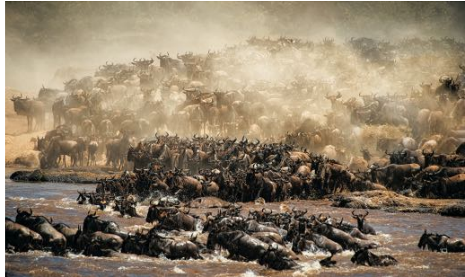
Wildebeest migration crossing the Mara River in Kenya, Africa, by Piper Mackay. Nikon D4, AF-S VR Zoom-Nikkor 200-400mm F4G IF-ED lens, focal length 550mm, f/8 at 1/800 second, center-weighted metering mode, auto exposure mode, ISO equivalent 200.

Plan to go at the best time. Many species migrate or give birth at a particular time in a particular location. Plan your trip around these extraordinary events. This was photographed during the annual wildebeest migration crossing the Mara River in Kenya. It has been said to be the greatest wildlife show on earth. Remember to pull back and capture the whole story. The mass of the animals and the dust kicking up gives big impact to this image. Large numbers of any species will add impact.