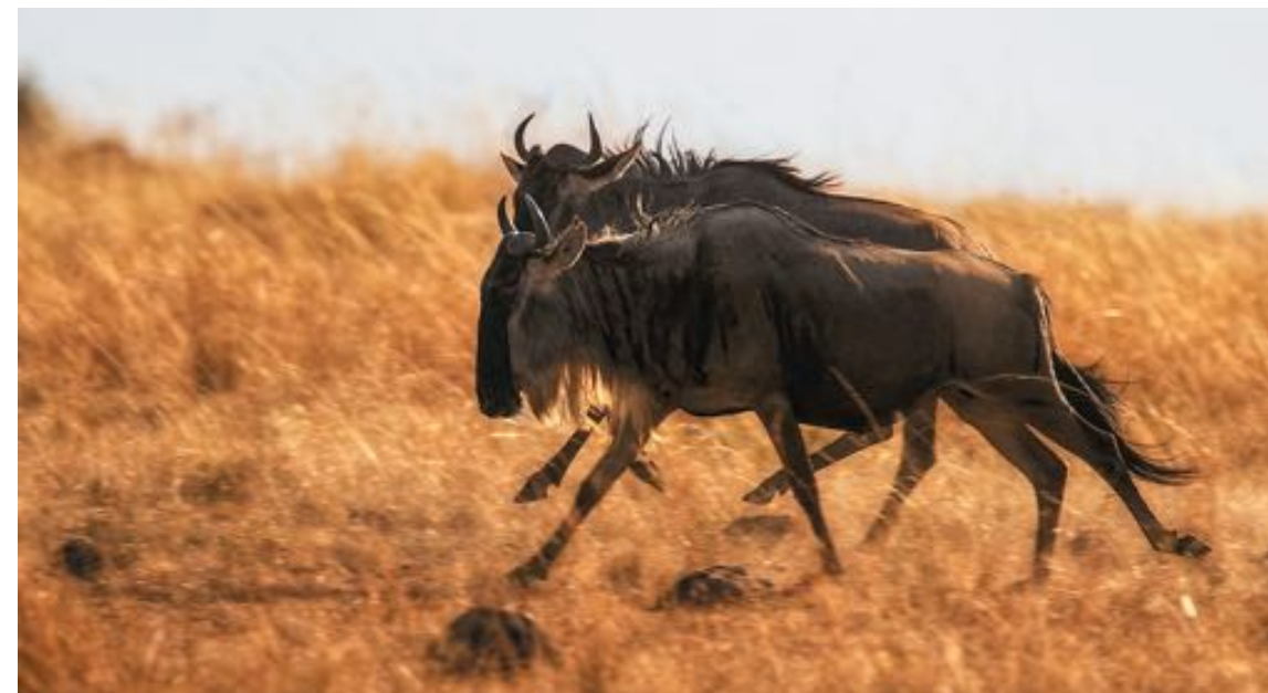
Wildebeest, Masai Mara, Kenya, Africa

Add motion to your image with a pan blur. In the first image you can see the animals are in motion; notice I have a little side lighting going for added impact. However, by panning with the animals to create a blur in the background it shows a more dramatic sense of speed and motion. To shoot a pan blur you need to slow down your shutter speed, 1/60-1/30 generally works, depending on the speed of your subject. You need to focus on the eye/shoulder of your subject while panning at the same speed as your subject, and holding down the shutter. Yes, this takes lots of practice and you will delete hundreds of images, but when you get one that works it is very exciting. This is something you can practice anywhere so when the opportunity comes you are ready.