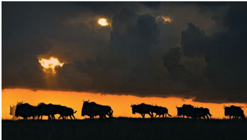
Wildebeest, Masai Mara, Kenya, Africa.

Backlighting generally creates a silhouette. You expose for the sky and the foreground will go black. You want to be lower than your subjects to be able to separate them from the ground. Otherwise, the horizon line will run through the middle of your subject and your subject will look like big blobs with no legs. Usually you want to separate the animals, nothing touching each other, or again they will look like one big blob. However, I loved the dramatic sky and how the line of wildebeest was perfectly framed between the horizon and dark clouds.