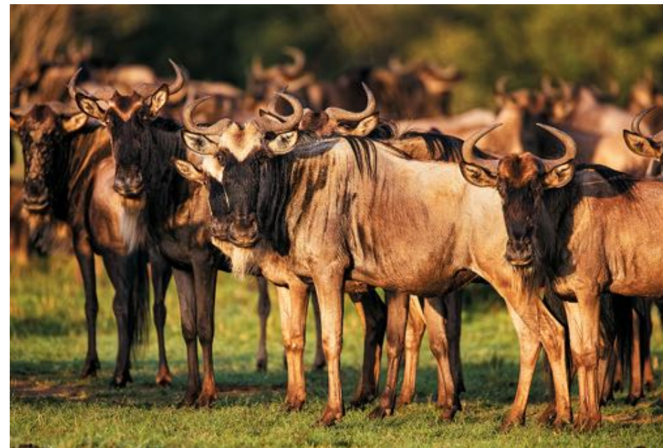
Wildebeest, Masai Mara, Kenya, Africa.

Backlighting and side lighting. It is natural to want the beautiful golden light on a wildlife subject as you see in the first photograph, so take the safe shot and then get creative. To make the image more dramatic, try side lighting as shown in the image below it. Side lighting works great on the wildebeest beards and it also creates some rim lighting. Rim light is when side lighting creates a lit edge around the subject. Side lighting also allows you to still capture the details in the subject.