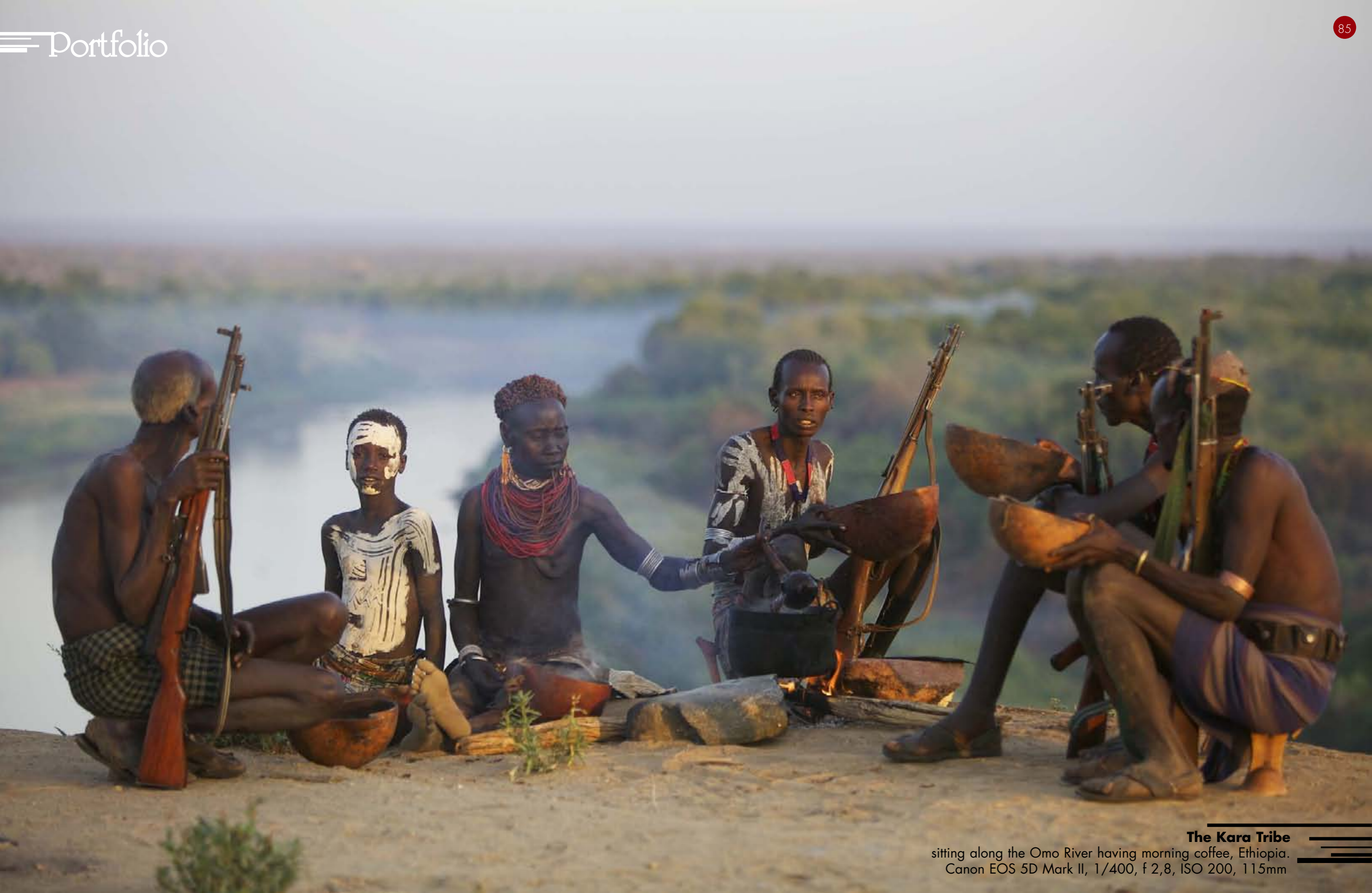
The Kara Tribe sitting along the Omo River having morning coffee, Ethiopia. Canon EOS 5D Mark II, 1/400, f 2,8, ISO 200, 115mm