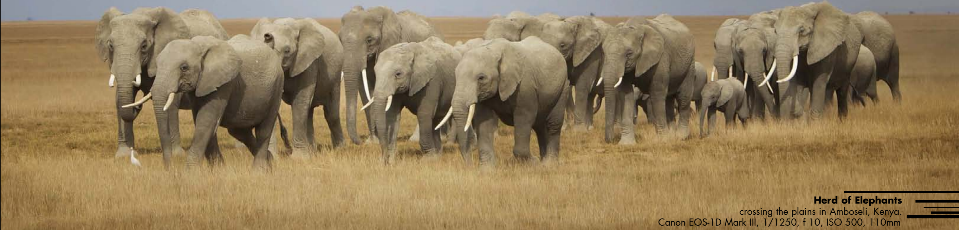
Herd of Elephants crossing the plains in Amboseli, Kenya. Canon EOS-1D Mark III, 1/1250, f 10, ISO 500, 110mm