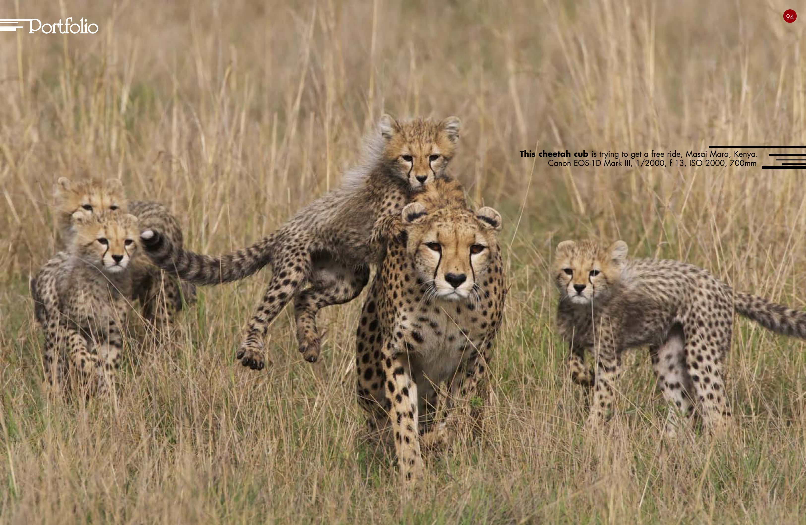
This cheetah cub is trying to get a free ride, Masai Mara, Kenya. Canon EOS-1D Mark III, 1/2000, f 13, ISO 2000, 700mm