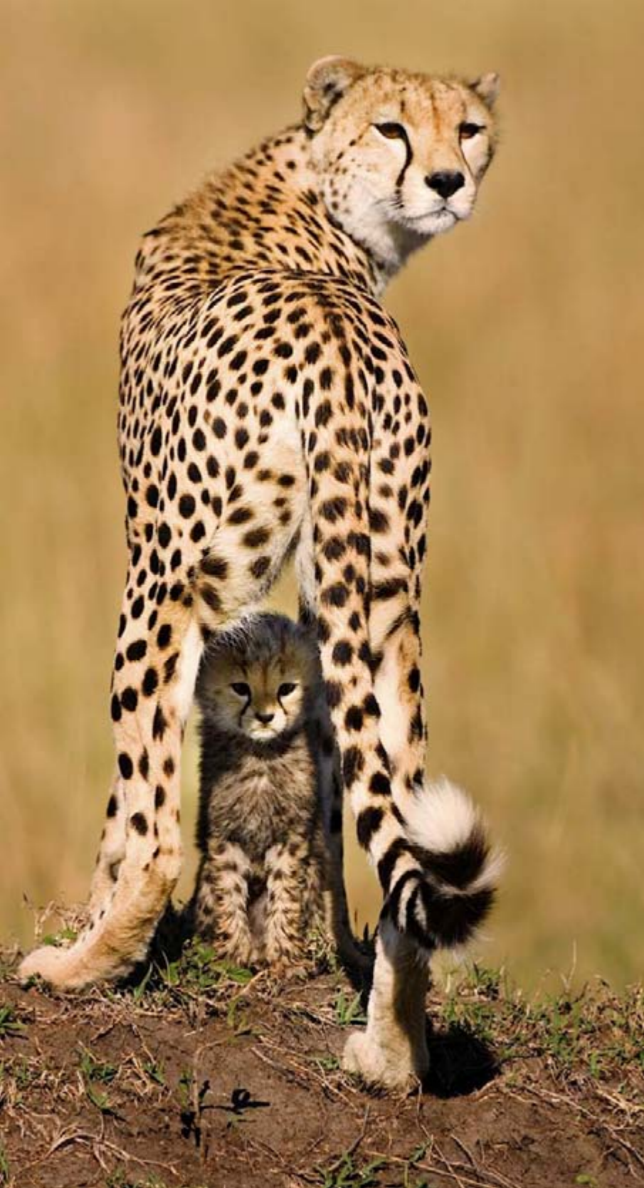
Miracle in the Mara , six cheetah cubs in the Masai Mara, Kenya. A rare opportunity as most cheetahs have between 3-4 cubs and mortality rate is as high as 95%. Canon EOS-1D Mark III, 1/2500, f 13, ISO 2000, 700mm