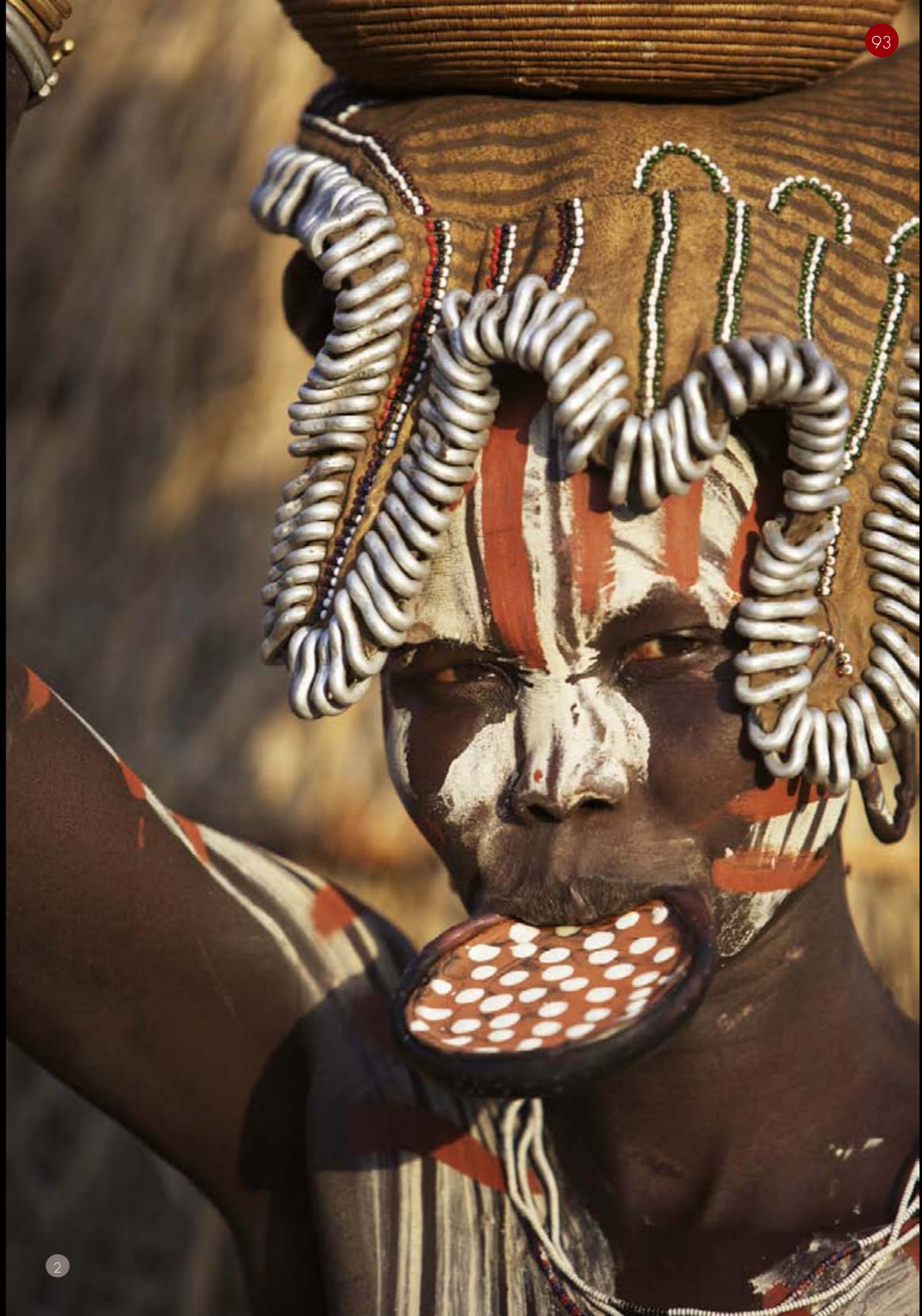
Portrait of a Mursi woman who wears orna- mental clay lip plates, elabo- rate headdresses and beauti- ful body paint, Omo Valley, Ethiopia. Canon EOS 5D Mark II, 1/1250, f 2,8, ISO 200, 200mm (2)