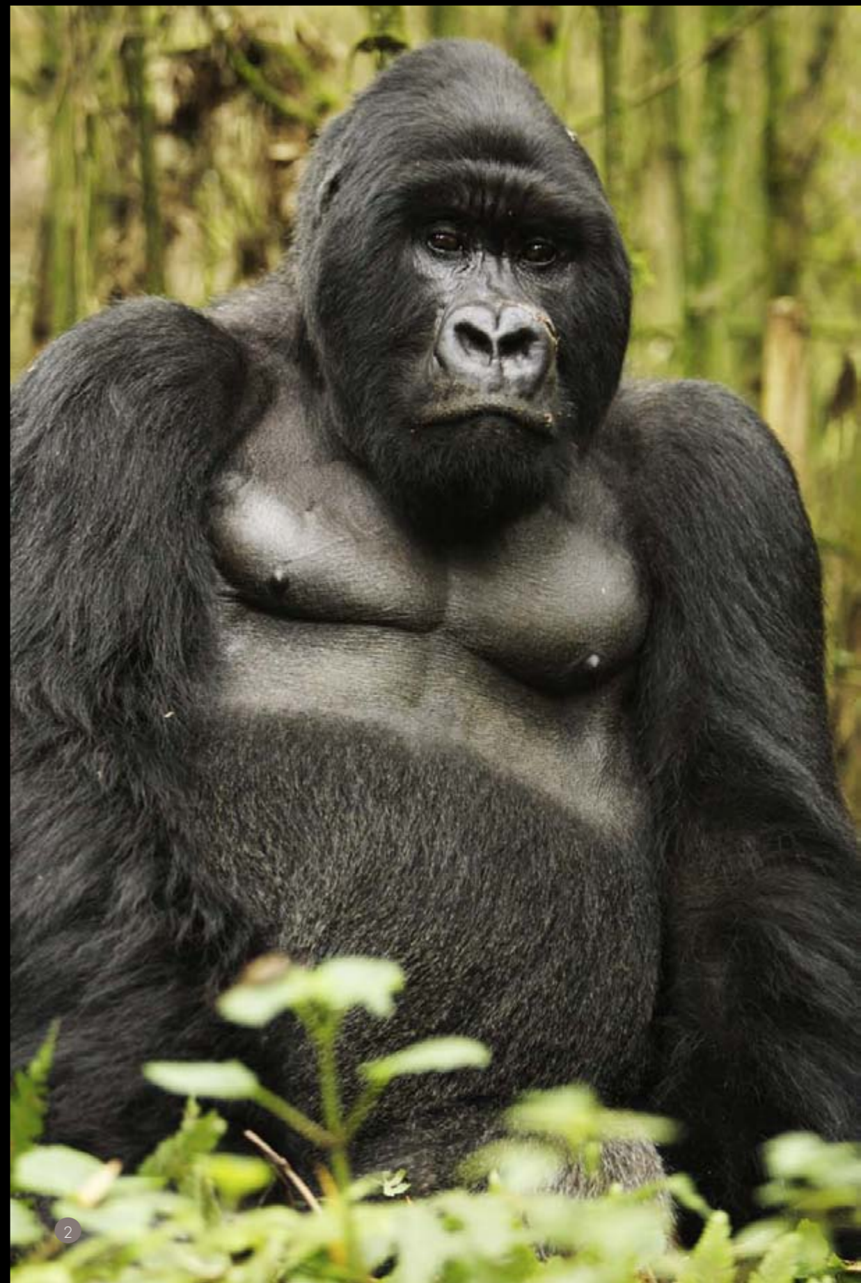
Portrait of a Silverback Mountain Gorilla , Virunga hills, Rwanda. Canon EOS-1D Mark II, 1/100, f 2,8, ISO 1250, 105mm (2)