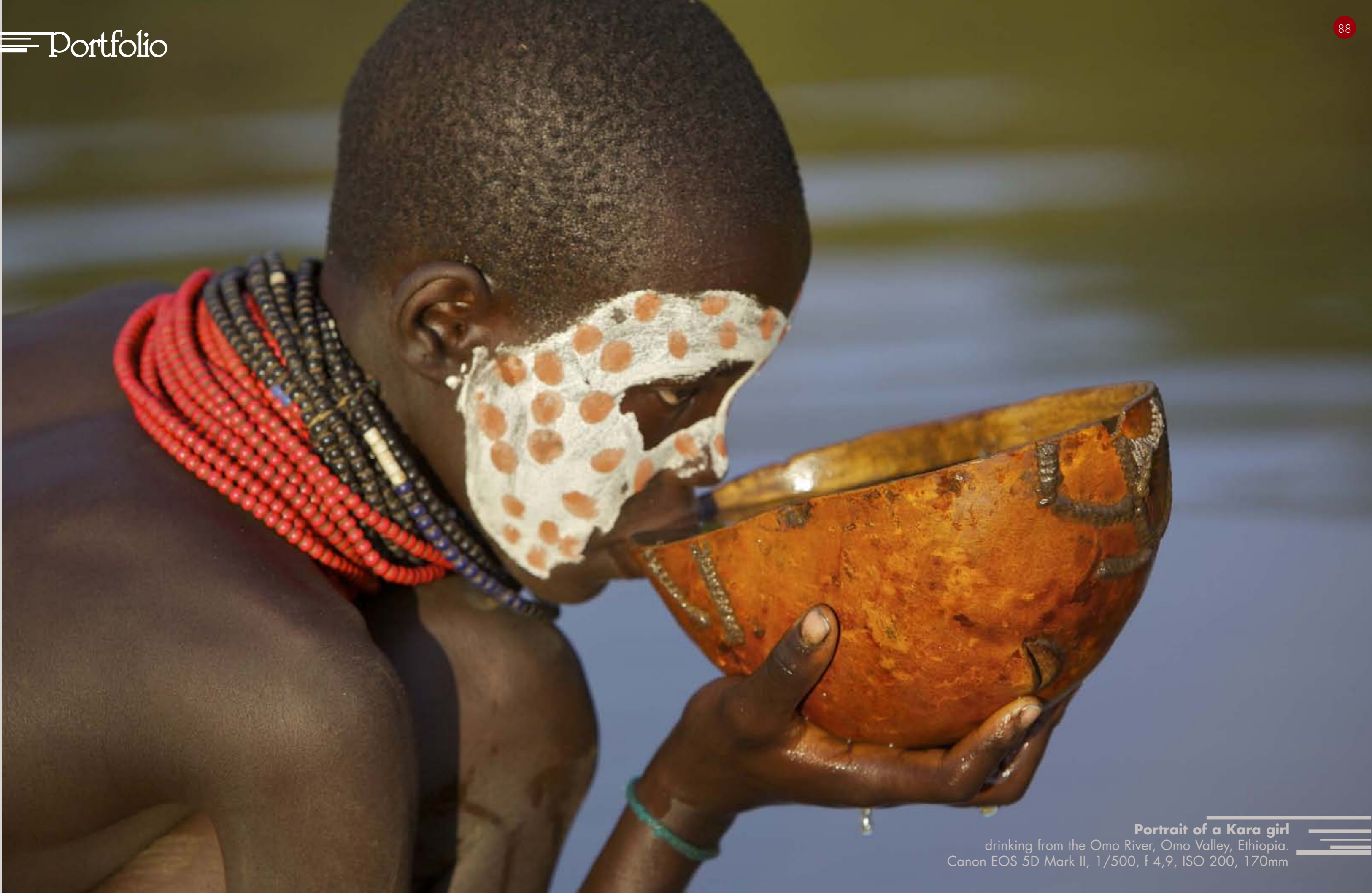
Portrait of a Kara girl drinking from the Omo River, Omo Valley, Ethiopia. Canon EOS 5D Mark II, 1/500, f 4,9, ISO 200, 170mm