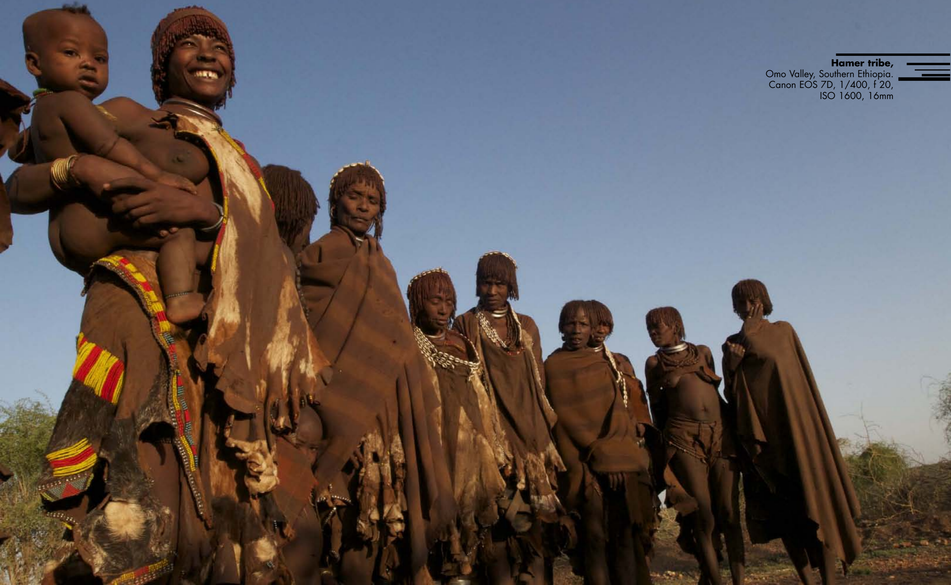
Hamer tribe, Omo Valley, Southern Ethiopia. Canon EOS 7D, 1/400, f 20, ISO 1600, 16mm