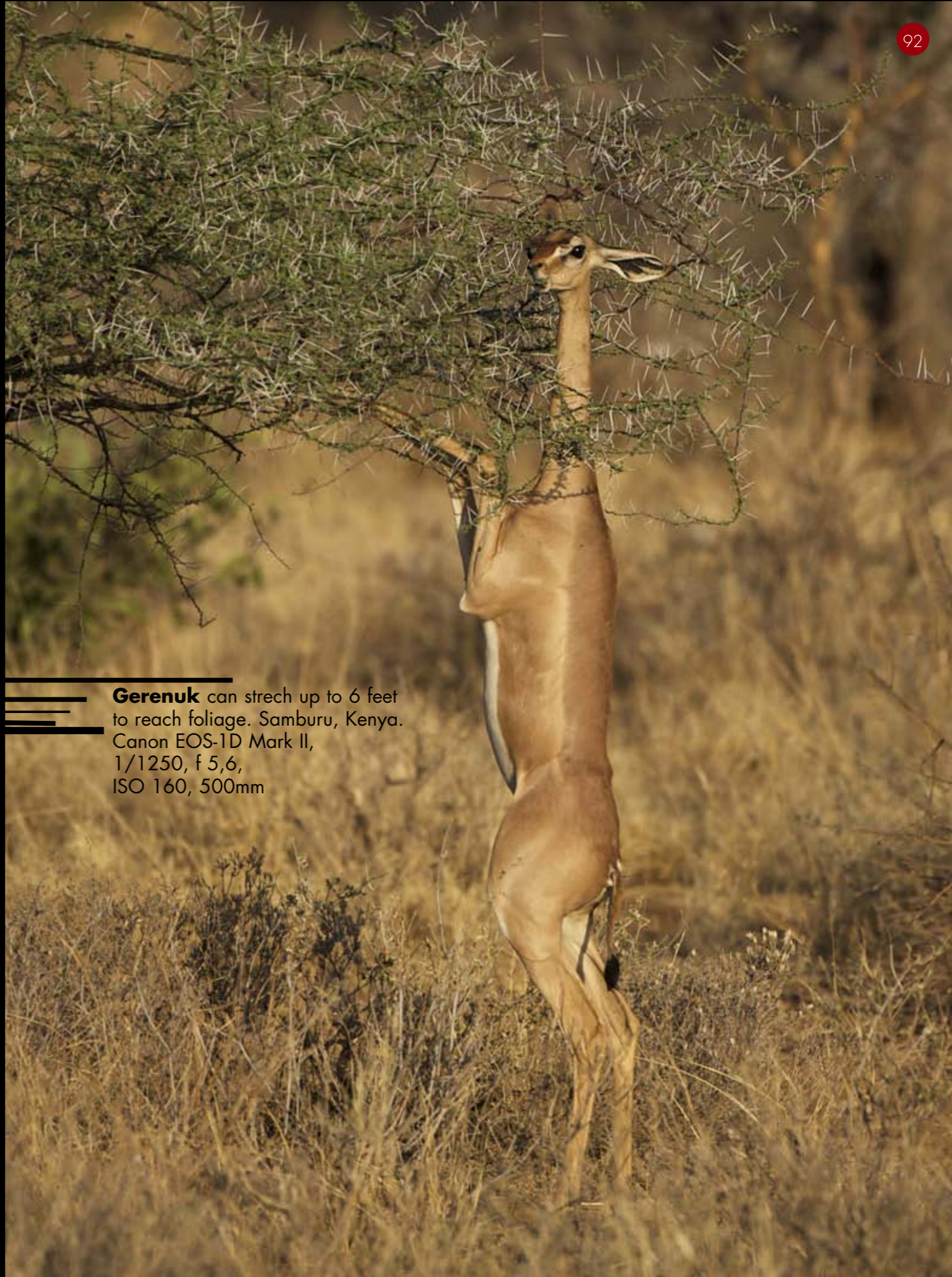
Gerenuk can stretch up to 6 feet to reach foliage. Samburu, Kenya. Canon EOS-1D Mark II, 1/1250, f 5,6, ISO 160, 500mm