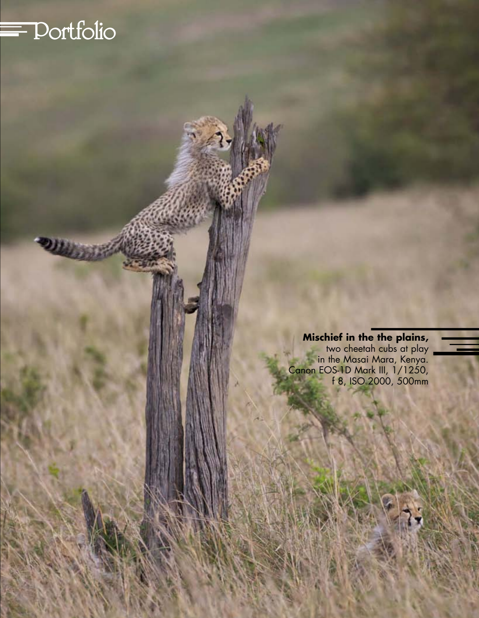
Mischief in the the plains, two cheetah cubs at play in the Masai Mara, Kenya. Canon EOS-1D Mark III, 1/1250, f 8, ISO 2000, 500mm