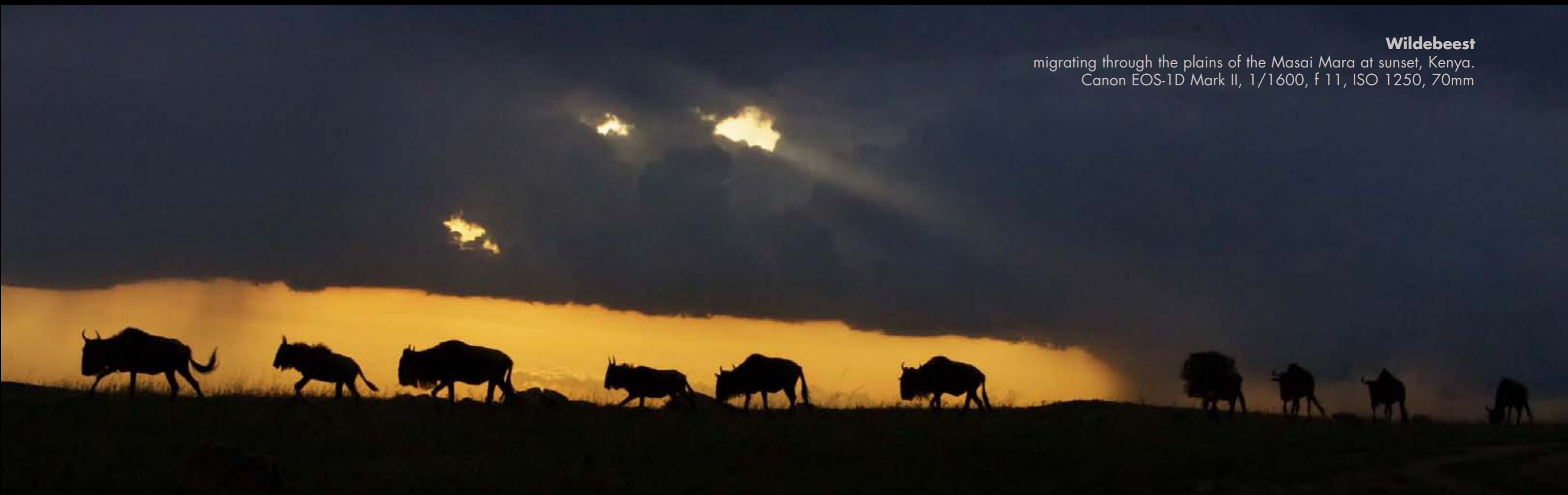
Wildebeest migrating through the plains of the Masai Mara at sunset, Kenya. Canon EOS-1D Mark II, 1/1600, f 11, ISO 1250, 70mm