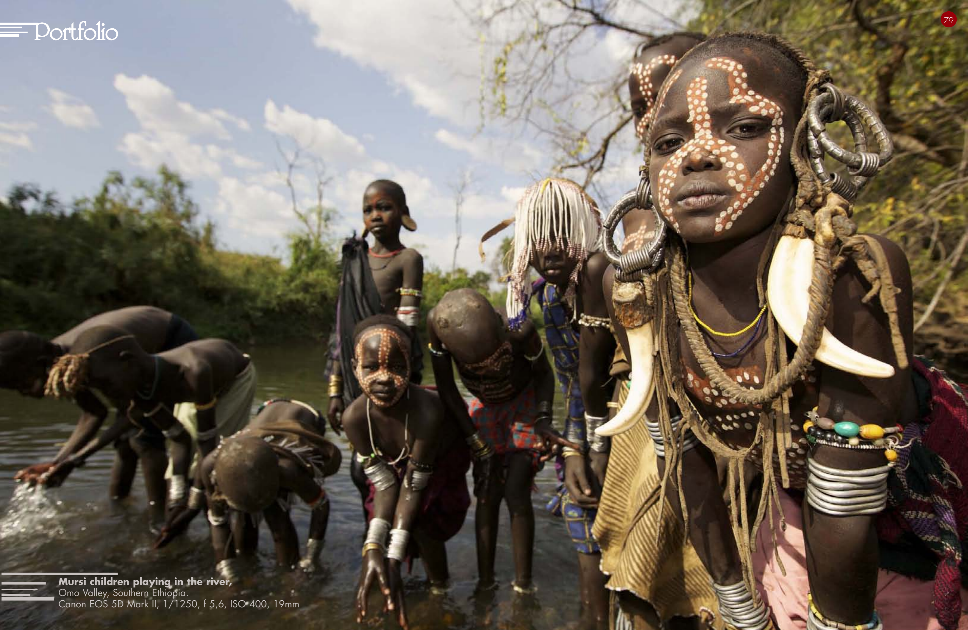
Mursi children playing in the river, Omo Valley, Southern Ethiopia. Canon EOS 5D Mark II, 1/1250, f 5,6, ISO 400, 19mm