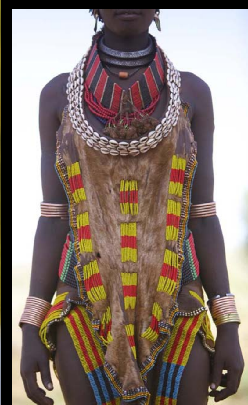
Beautiful colorful beaded skins worn by the Hamar women, Omo Valley, Southern Ethiopia. Canon EOS 5D Mark II, 1/8000, f 2,8, ISO 1600, 120mm