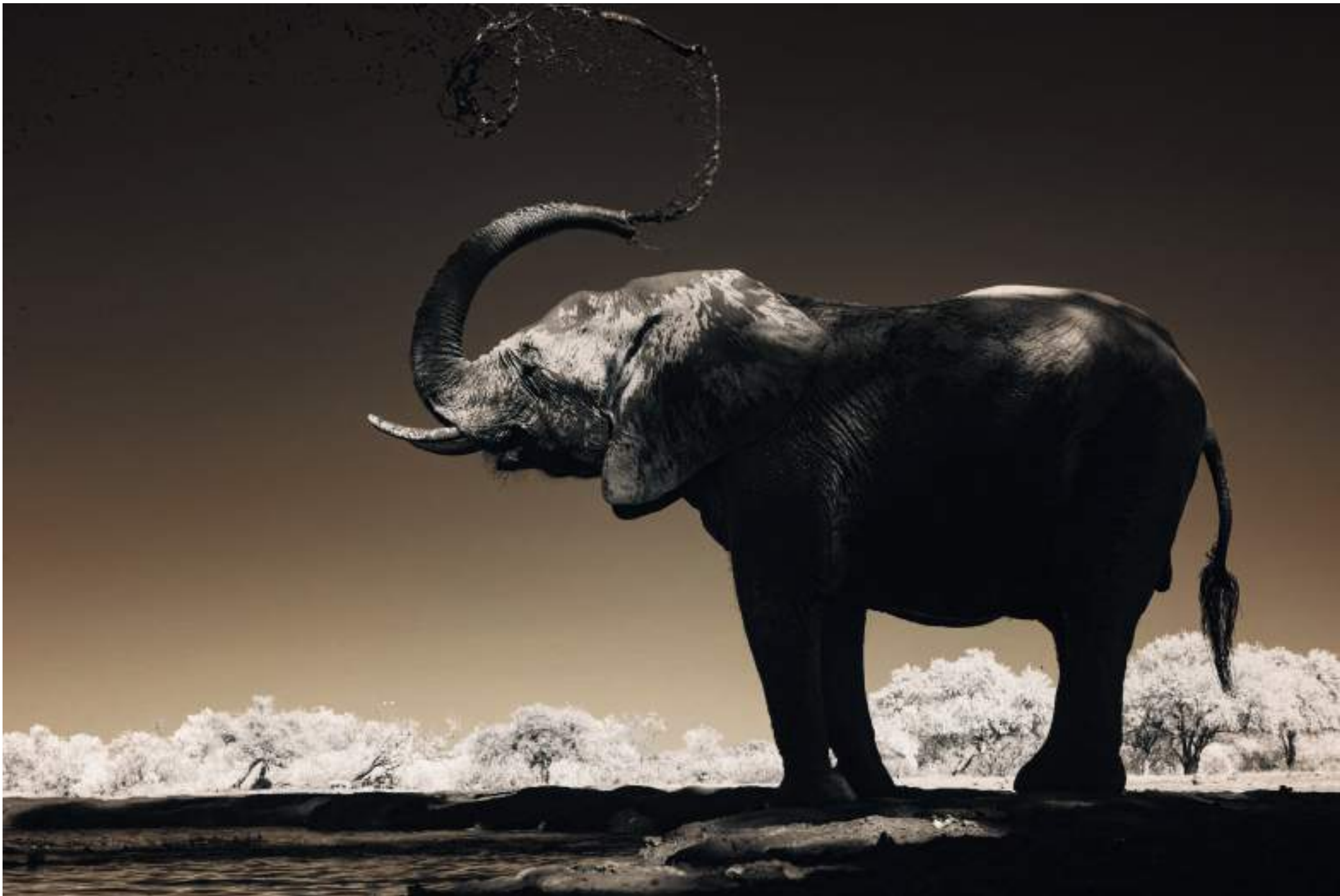
PIPER MACKAY ELEPHANT AFRICA INFRARED USA

WEBSITE: pipermackay.com INSTAGRAM: @piper_mackay